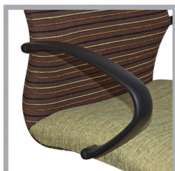
LC 35 - Slimline Polyurethane