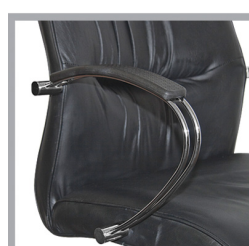
LC 75 - Polyurethane Pad