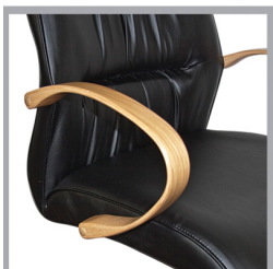
LC 30 - Slimline Wood