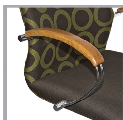
LC 70 - Wood Pad